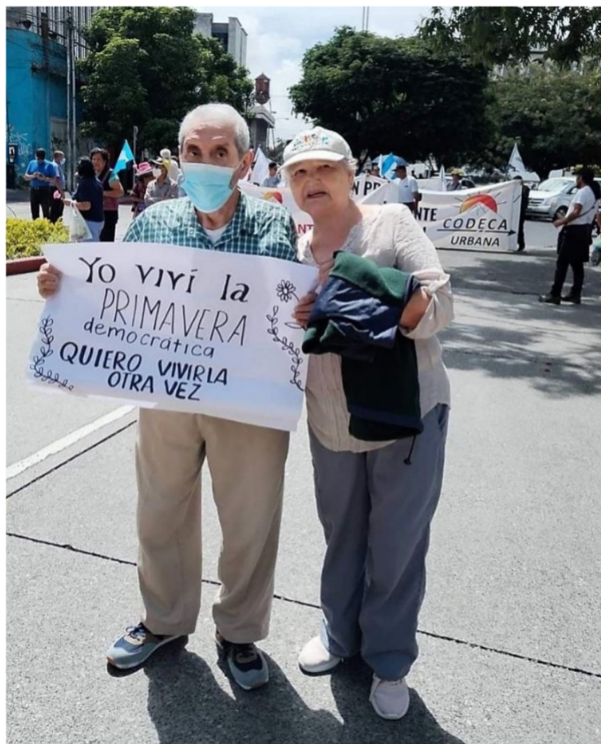
A couple holds a sign at a protest in Guatemala reading, “I lived through the democratic SPRING. I want to live it again.”

It is not lost on Guatemalan voters that today’s Semilla party candidate, Bernardo Arévalo, is the son of former President Jose Arévalo. As the younger Arévalo has vowed to carry out his father’s legacy, Covenant of the Corrupt elites are determined to stop the possibility of truly democratic government coming to power, with a second President Arévalo at the helm.