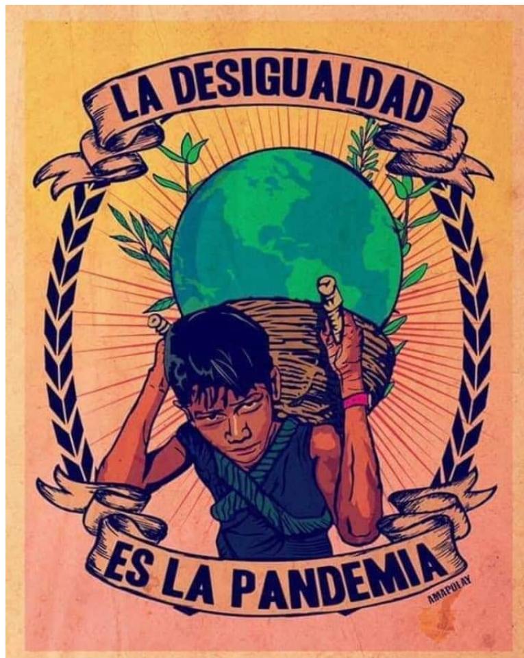
Inequality is the pandemic

“A long arc of dirty colonial coups, capitalist trade agreement extracting land and labor, climate change, and enforced oppression is the primary driver of displacement from Mexico and Central America.”