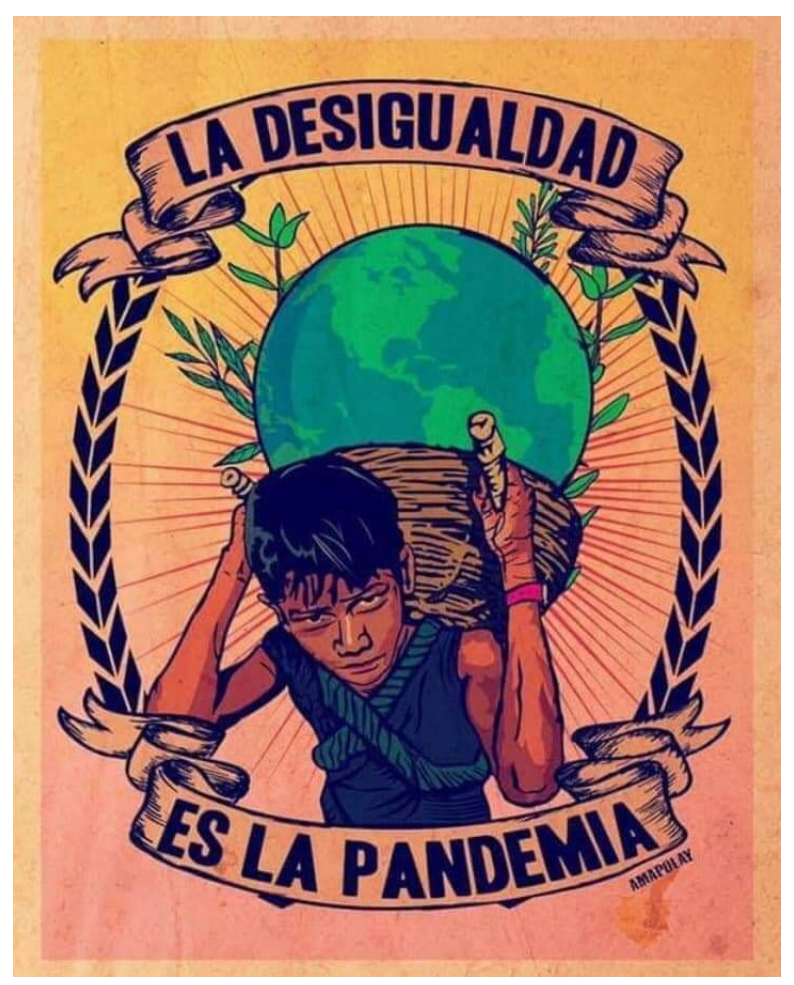
Inequality is the pandemic

"A long arc of dirty colonial coups, capitalist trade agreement extracting land and labor, climate change, and enforced oppression is the primary driver of displacement from Mexico and Central America."