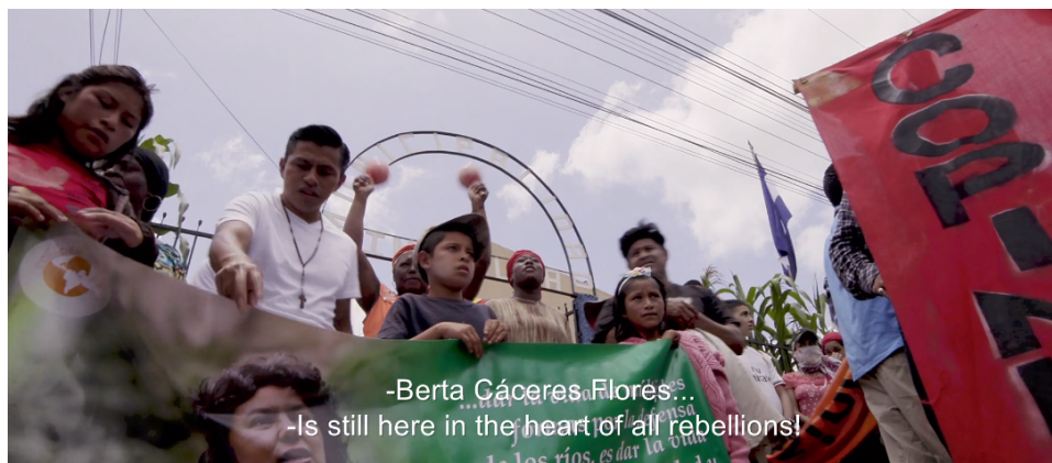
(Screenshots from film trailer)