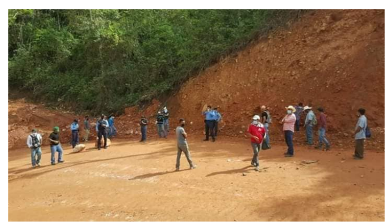
Azacualpa community members peacefully blocking mining company access, June 14, 2020.

As Covid19 further devastates the lives of the poor majority in Honduras, Azacualpa villagers see even more need to do whatever they can to peacefully stop this mine.