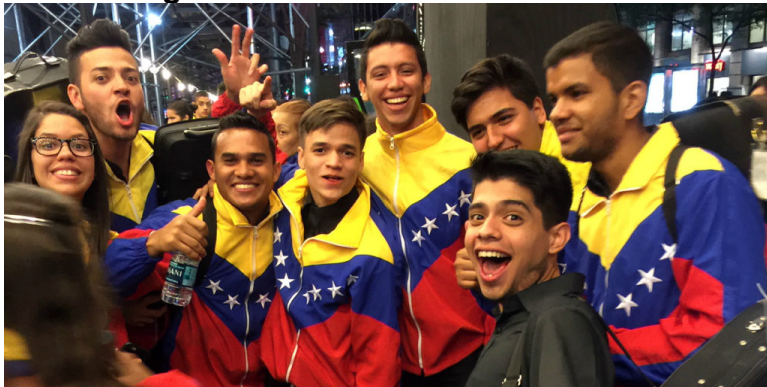
Venezuelan Youth Orchestra in New York City, 2016

In fact, I myself wouldn’t have believed anyone who made such claims without being able to produce the proof, so intense and unrelenting has been the drumbeat of lies.