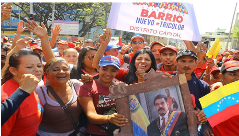
Supporters of Venezuelan President Nicolas Maduro

Hard as it may be for followers of the US media to believe, Venezuela is a country where people play sports, go to work, go to classes, go to the beach, go to restaurants and attend concerts. They publish and read newspapers of all political stripes, from right to center-right, to center, to center-left, to left. They produce and watch programs on television, on TV channels that are also of all political stripes.