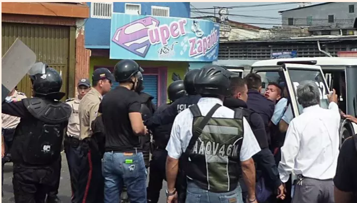
Police arrest students during a protest against Venezuelan President Nicolas Maduro in San Cristobal. Two officers died and four more were hurt

Fears rise as evidence mounts of ‘state failure’ amid escalating violence