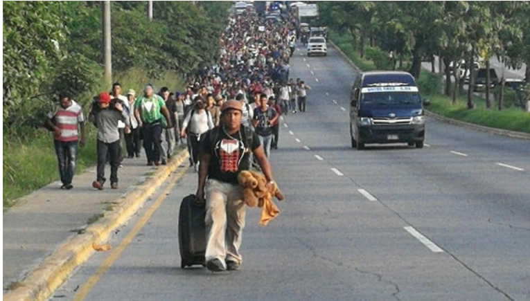
October 14: walking north through Honduras to the Guatemalan border

By Grahame Russell (Rights Action), Honduras, October 16, 2018 https://mailchi.mp/rightsaction/forced-migrancy-caravan