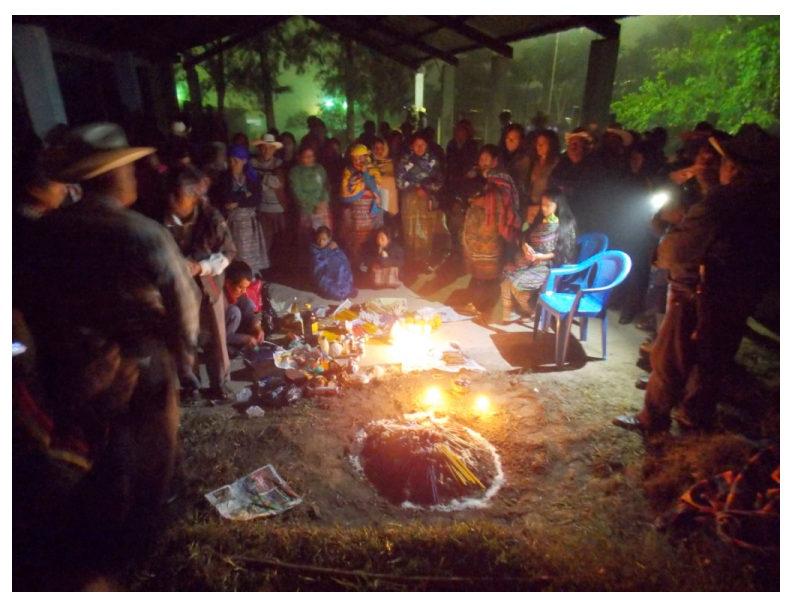
(Mayan ceremony, Pacux neighborhood, for victims of the Los Encuentros massacre, the 3rd of 4 Chixoy Day/Rio Negro massacres.)