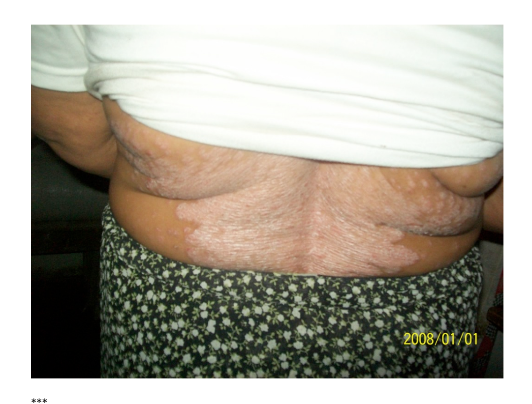
#2418 - ERNESTINA ACOSTA, GUAYABILLAS, 40 YEARS