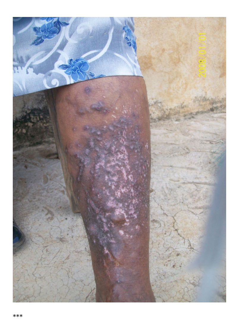
#2420 - CLEMENTINA VELASQUEZ, EL PEDERNAL, 28 YEARS