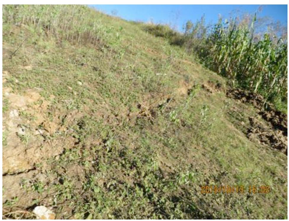
(All pictures by FREDEMI, October 13, 2012)

BELOW: Communique from FREDEMI, the San Miguel Ixtahuacan Defense Front, about the latest harms caused by Goldcorp's "Marlin" mine, operating since 2005.