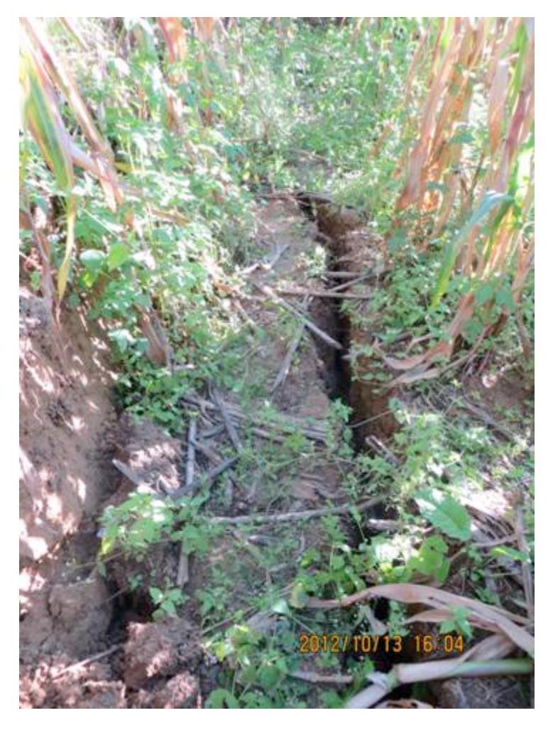
FREDEMI, the San Miguel Ixtahuacan Defense Front, sends this information nationally and internationally. FREDEMI invites any concerned people and organizations to come and see for themselves. FREDEMI holds Goldcorp responsible for these harms that cause so much insecurity and injustice for the families of Agel.