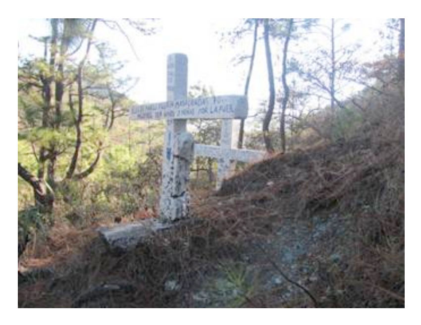
(Site of the March 13, 1982 massacre of 177 women and children from the Mayan Achi village of Rio Negro.)

This massacre was one of 4 programmed massacres planned and carried out in 1982 by the Guatemalan military, so as to forcibly "evict" [exterminate] the villagers of Rio Negro, so as to make way for the Chixoy dam hydro-electric dam, a "mega-development" project of the World Bank (WB) and the IDB (Inter-American Development Bank).