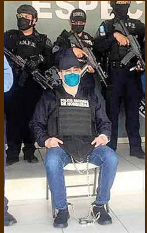
Ousted "President" Juan Orlando Hernandez, for 12 years and 7 months a staunch "democracy ally" of the U.S. and Canada

https://mailchi.mp/rightsaction/breaking-news