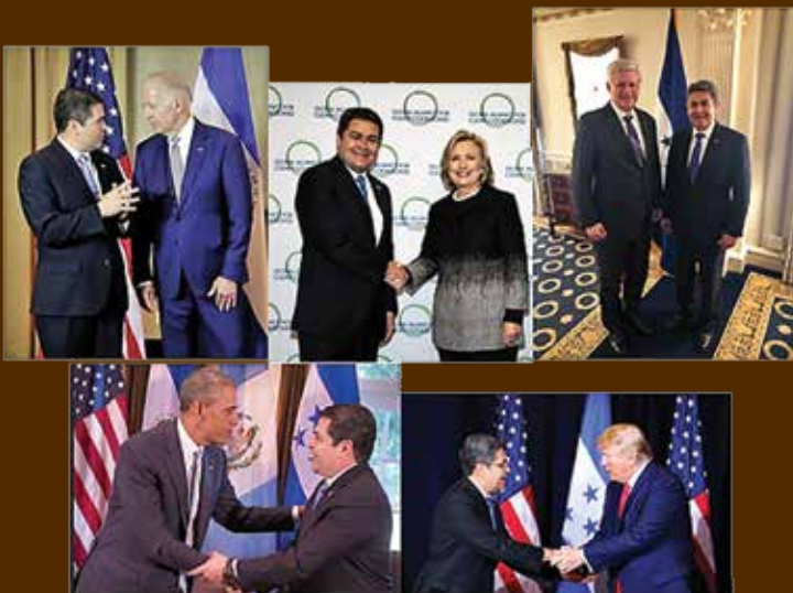
The 'Rot in Honduras' goes through to Honduras' international partners, here glad-handing with "democratic ally" President Juan Orlando Hernandez