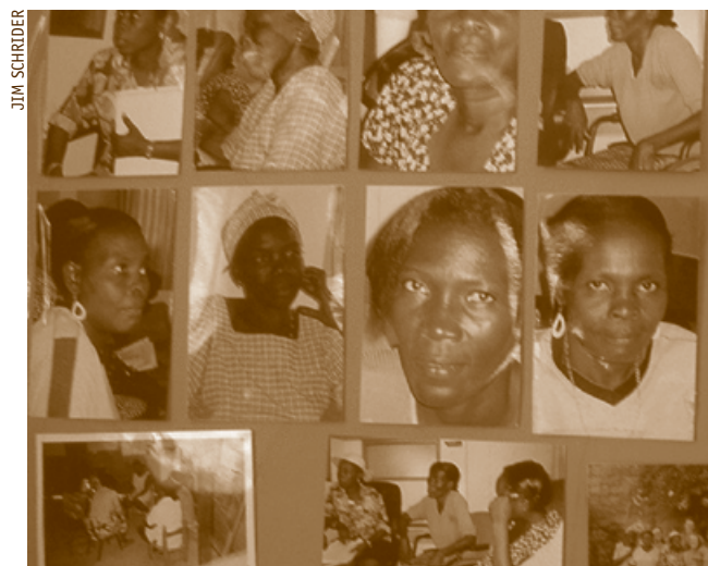
Collage of KOFIV women.

At the same time, we need to work on the international aspects by looking at what the global actors are doing. We can do this by monitoring the forms of aid and assistance coming into the country and analyzing the impact of international policies on the realization or denial of the right to health. Eventually, we want to have a health commission at VIDWA in